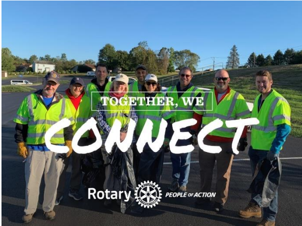
Highway Clean Up Orr's Bridge Road, Mechanicsburg